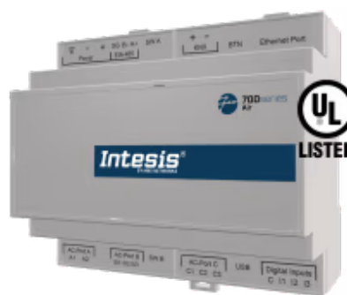
Mitsubishi Heavy Industries to KNX - Up to 4 Indoor Units

The Mitsubishi Heavy Industries application has been specially designed to allow bidirectional control and monitoring of Mitsubishi Heavy Industries VRF systems from a KNX installation. The solution allows the integration of up to 4 indoor units from a single interface.