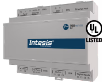
Fujitsu to Modbus TCP/RTU - Up to 4 Indoor Units

The Fujitsu application has been specially designed to allow bidirectional control and monitoring of Fujitsu VRF systems from a BMS, SCADA, PLC, or any other device working as a Modbus client. The solution allows the integration of up to 4 indoor units from a single interface.