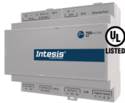
Mitsubishi Electric City to Home Automation - Up to 15 groups

The Mitsubishi Electric application has been specially designed to allow bidirectional control and monitoring of Mitsubishi Electric City Multi systems from a Home Automation system. The solution allows the integration of up to 15 groups from a single interface.