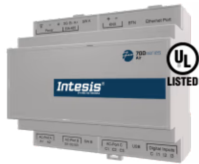
Hisense to Home Automation - Up to 4 Indoor Units

The Hisense application has been specially designed to allow bidirectional control and monitoring of Hisense VRF systems from a Home Automation system. The solution allows the integration of up to 4 indoor units from a single interface.