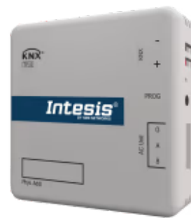
Haier to KNX - 8 indoor units

The Haier-KNX gateway allows bidirectional communication between Haier Commercial and VRF systems and KNX installations. This communication brings total control of the AC unit from KNX, including monitoring of the AC unit's internal variables, running hours counter (for filter maintenance control), and error codes.