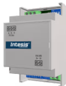
Fujitsu to Modbus - 1 indoor unit

The Fujitsu-Modbus interface allows full bidirectional communication between Fujitsu RAC and VRF systems and Modbus RTU (RS-485) networks. The interface acts as a server device for the installation, accessing all signals from the air conditioner unit. A wired remote controller can also be part of the network.