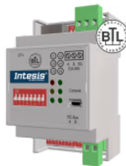
Hitachi to BACnet/IP & MS/TP - 1 indoor unit

The Hitachi-BACnet interface allows full bidirectional communication between Hitachi VRF units and BACnet/IP or MS/TP networks. The interface enables BACnet communication via polling or subscription requests (COV), making the indoor unit available through independent BACnet objects. A wired remote controller can also be connected.