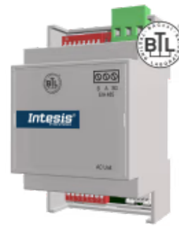
Daikin to BACnet MS/TP - 1 indoor unit

The Daikin-BACnet interface allows full bidirectional communication between Daikin Domestic air conditioner units and BACnet MS/TP networks. The interface enables BACnet communication via polling or subscription requests (COV), making the indoor unit available through independent BACnet objects.