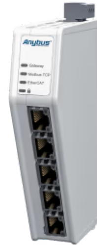
A protocol converter that connects Modbus-TCP and EtherCAT control systems

The Anybus Communicator Modbus-TCP server to EtherCAT slave enables you to connect any Modbus-TCP control system to any EtherCAT control system. Anybus Communicators ensure reliable, secure, high-speed data transfers between different industrial networks. Thanks to our intuitive web-based user interface, they're also incredibly easy to use.