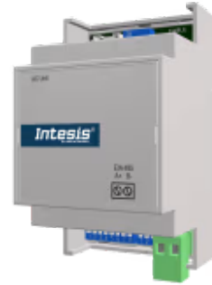
Mitsubishi Electric Domestic to Modbus - 1 indoor unit

The Mitsubishi Electric-Modbus interface allows full bidirectional communication between Mitsubishi Electric Domestic, Mr. Slim, and City Multi air conditioner units and Modbus RTU (RS-485) networks. The interface acts as a server device for the installation, accessing all signals from the air conditioner unit.