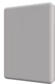
Daikin to Home Automation - 1 indoor unit

The Daikin gateway allows complete and natural integration of Daikin VRV and Sky systems into IP-based Home Automation Systems. The device connects to the indoor unit through a direct cable and to the Home Automation interface via Wi-Fi. A wired remote controller can also be connected.