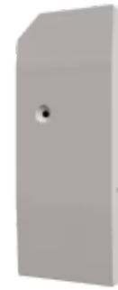
Mitsubishi Heavy Industries to Home Automation - 1 indoor unit

The Mitsubishi Heavy Industries gateway allows complete and natural integration of Mitsubishi Heavy Industries Domestic Air Conditioner units into IP-based Home Automation systems. The device connects to the indoor unit through a direct cable and to the Home Automation interface via Wi-Fi.