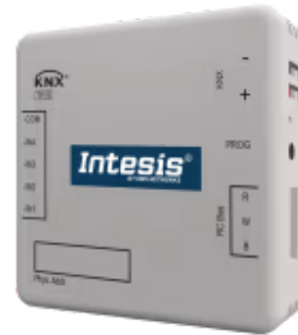
Fujitsu to KNX - 1 indoor unit

The Fujitsu-KNX interface allows full bidirectional communication between Fujitsu RAC and VRF units and KNX installations. It has four potential-free binary inputs to integrate external devices (such as window contacts or presence detectors), with the corresponding internal functions available to help improve energy efficiency.