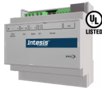
DALI-2 to Modbus TCP - 1 DALI channel

Integrate any DALI/DALI-2 driver and DALI-2 light sensor or occupancy sensor with a Modbus BMS or any Modbus TCP controller. This integration aims to make DALI devices and their data and resources accessible from a Modbus-based control system or device as if they were a part of the Modbus system and viceversa.