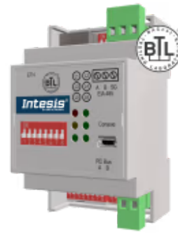
Toshiba to BACnet/IP & MS/TP - 1 indoor unit

The Toshiba-BACnet interface allows full bidirectional communication between Toshiba VRF and Digital Air Conditioner units and BACnet/IP or MS/TP networks. It enables BACnet communication via polling or subscription requests (COV), making the indoor unit available through independent BACnet objects. A wired remote controller can also be connected.