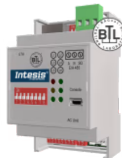
Mitsubishi Electric Domestic to BACnet/IP & MS/TP - 1 indoor unit

The Mitsubishi Electric-BACnet interface allows full bidirectional communication between Mitsubishi Electric domestic, Mr. Slim, and City Multi air conditioner units and BACnet/IP or MS/TP networks. It enables BACnet communication via polling or subscription requests (COV), making the indoor unit available through independent BACnet objects.