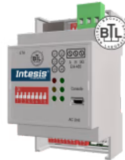
Panasonic to BACnet/IP & MS/TP - 1 indoor unit

The Panasonic-BACnet interface allows full bidirectional communication between Panasonic Etherea Air Conditioner units and BACnet/IP or MS/TP networks. The interface enables BACnet communication via polling or subscription requests (COV), making the indoor unit available through independent BACnet objects.