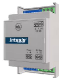
Daikin to Modbus RTU Interface - 1 indoor unit

The Daikin-Modbus interface allows full bidirectional communication between Daikin VRV systems and Modbus RTU (RS-485) networks. The interface acts as a server device for the installation, accessing all signals from the air conditioner unit.