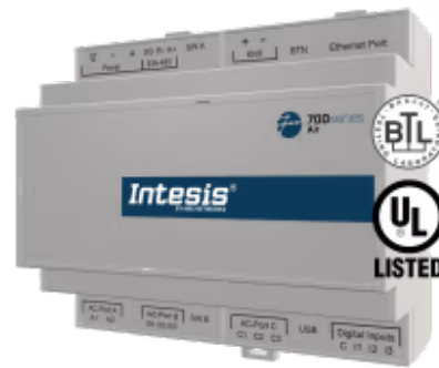
Hisense to BACnet/IP & MS/TP - Up to 4 Indoor Units

The Hisense application allows bidirectional control and monitoring of Hisense VRF systems from a BMS, SCADA, PLC, or any controller working as a BACnet/IP server or a BACnet MS/TP client. This solution allows the integration of up to 4 indoor units.