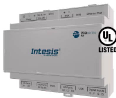
Hitachi to Home Automation - Up to 64 Indoor Units

The Hitachi VRF application has been specially designed to allow bidirectional control and monitoring of Hitachi VRF systems from a Home Automation system. The solution allows the integration of up to 64 indoor units from a single interface.