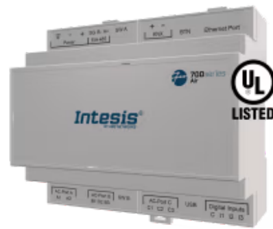
Hisense to Home Automation - Up to 16 Indoor Units

The Hisense application has been specially designed to allow bidirectional control and monitoring of Hisense VRF systems from a Home Automation system. The solution allows the integration of up to 16 indoor units from a single interface.