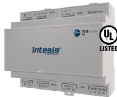
Mitsubishi Electric to Modbus TCP/RTU - Up to 50 groups

The Mitsubishi Electric application has been specially designed to allow bidirectional control and monitoring of Mitsubishi Electric City Multi systems from a BMS, SCADA, PLC, or any other device working as a Modbus client. The solution allows the integration of up to 50 groups from a single interface.