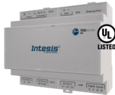
Mitsubishi Electric to KNX - Up to 50 groups

The Mitsubishi Electric application has been specially designed to allow bidirectional control and monitoring of Mitsubishi Electric City Multi systems from a KNX installation. The solution allows the integration of up to 50 groups from a single interface.