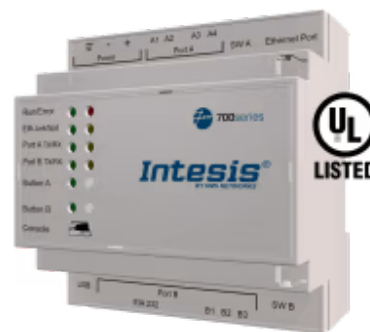
KNX to Modbus TCP & RTU - 3000 points

Integrate any KNX device or installation with a Modbus BMS or any Modbus TCP or Modbus RTU controller. This integration aims to make KNX communication objects and resources accessible from a Modbus-based control system or device as if they were a part of the Modbus system and vice versa.