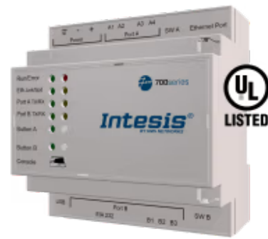
KNX to Modbus TCP & RTU - 1200 points

Integrate any KNX device or installation with a Modbus BMS or any Modbus TCP or Modbus RTU controller. This integration aims to make KNX communication objects and resources accessible from a Modbus-based control system or device as if they were a part of the Modbus system and vice versa.