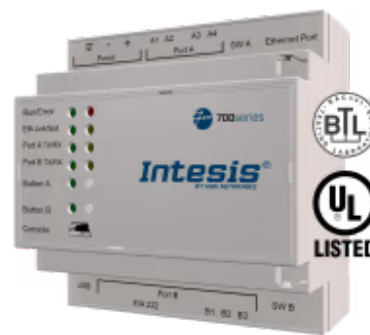
BACnet/IP & MS/TP to ASCII IP & Serial - 250 points

Integrate any BACnet MS/TP or BACnet/IP server device with an ASCII BMS or any ASCII IP or ASCII serial controller. This integration aims to make BACnet objects, data, and resources accessible from an ASCII-based control system or device as if they were a part of the ASCII system and vice versa.