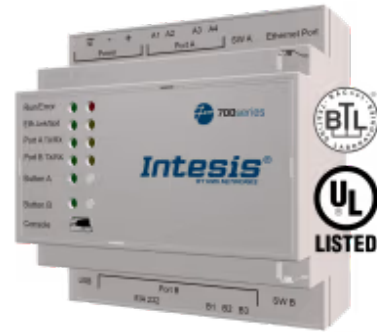
BACnet/IP & MS/TP to Modbus TCP & RTU - 3000 points

Integrate any BACnet MS/TP or BACnet/IP server device with a Modbus BMS or any Modbus TCP or RTU controller. This integration aims to make BACnet objects, data, and resources accessible from a Modbus-based control system or device as if they were a part of the Modbus system and vice versa.