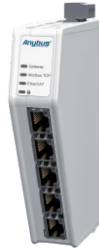
A protocol converter that connects EtherCAT devices to Modbus TCP control systems

The Anybus Communicator EtherCAT MainDevice to Modbus TCP enables you to connect any EtherCAT device to Modbus TCP control systems. Anybus Communicators ensure reliable, secure, and high-speed data transfer between different industrial networks. Thanks to our intuitive web-based user interface, they're also incredibly easy to use.