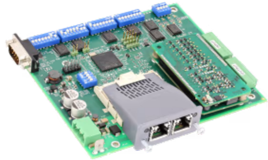
Safe communication through Functional Safety over EtherCAT (FSoE)

The Ixxat Safe T100/FSoE offers an easy way to implement safe I/O signals into industrial devices, using the Functional Safety over EtherCAT (FSoE) protocol. The Development Kit is an all-in-one solution for evaluation purposes, featuring essential components like a base board with an Anybus CompactCom module, CPU, and a safety module.