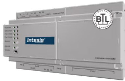
PROFINET to BACnet/IP & MS/TP - 1200 points

The Intesis BACnet-PROFINET gateway allows you to seamlessly interconnect PLC/BMS systems and their connected devices between BACnet/IP and MS/TP control systems and PROFINET networks. The gateway works as a BACnet server on the BACnet side and as a PROFINET I/O device on the PROFINET side and is configured via the Intesis MAPS configuration tool.