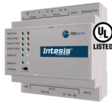
LG to KNX - 16 indoor units

The LG interface has been specially designed to allow bidirectional control and monitoring of LG VRF systems from a KNX installation. This enables the control of all the indoor units connected to the system, the monitoring of the main AC functions, and access to some internal variables of the outdoor units.