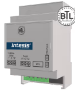
ST Cloud Control to BACnet MS/TP or IP or Modbus RTU and TCP - 4 devices

Intesis ST Cloud Control is a bidirectional cloud-based solution to monitor and control any BACnet or Modbus device, whether from a web-based dashboard or an end-user-oriented app. The solution allows the integration of up to 4 devices, with up to 12 widgets per device. Widgets can be shared/split between the devices connected to the same gateway.