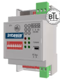
Hitachi to BACnet/IP & MS/TP - 1 indoor unit

The Hitachi-BACnet interface allows full bidirectional communication between Hitachi VRF units and BACnet/IP or MS/TP networks. The interface enables BACnet communication via polling or subscription requests (COV), making the indoor unit available through independent BACnet objects. A wired remote controller can also be connected.