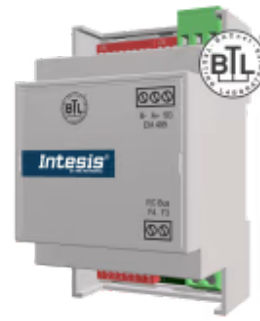
Samsung to BACnet MS/TP - 1 indoor unit

The Samsung BACnet interface allows full bidirectional communication between Samsung NASA air conditioner indoor units and BACnet MS/TP networks. It enables BACnet communication via polling or subscription requests (COV), making the indoor unit available through independent BACnet objects. A wired remote controller can also be connected.