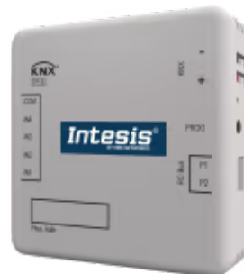
Daikin to KNX - 1 indoor unit

The Daikin-KNX interface allows full bidirectional communication between Daikin VRV and Sky systems and KNX installations. It has four potential-free binary inputs to integrate external devices (such as window contacts or presence detectors), with the corresponding internal functions available to help improve energy efficiency.