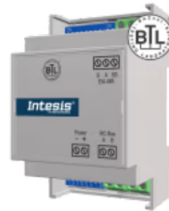
Toshiba to BACnet MS/TP - 1 indoor unit

The Toshiba-BACnet interface allows full bidirectional communication between Toshiba VRF and Digital air conditioner units and BACnet MS/TP networks. It enables BACnet communication via polling or subscription requests (COV), making the indoor unit available through independent BACnet objects. A wired remote controller can also be connected.