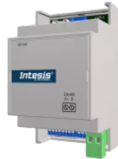
Mitsubishi Electric Domestic to Modbus - 1 indoor unit

The Mitsubishi Electric-Modbus interface allows full bidirectional communication between Mitsubishi Electric Domestic, Mr. Slim, and City Multi air conditioner units and Modbus RTU (RS-485) networks. The interface acts as a server device for the installation, accessing all signals from the air conditioner unit.