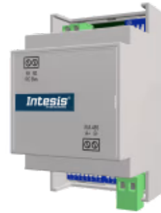
Panasonic to Modbus RTU - 1 indoor unit

The Panasonic-Modbus interface allows full bidirectional communication between Panasonic ECOi and PACi air conditioner units and Modbus RTU (RS-485) networks. The interface acts as a server device for the installation, accessing all signals from the air conditioner unit. A wired remote controller can also be part of the network.