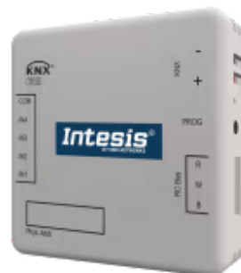
Fujitsu to KNX - 1 indoor unit

The Fujitsu-KNX interface allows full bidirectional communication between Fujitsu RAC and VRF units and KNX installations. It has four potential-free binary inputs to integrate external devices (such as window contacts or presence detectors), with the corresponding internal functions available to help improve energy efficiency.