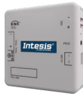
Hitachi to KNX - 1 AW indoor unit

The Hitachi-KNX interface allows full bi-directional communication between Hitachi Air-to-Water systems and KNX installations. It connects directly to the indoor unit and delivers complete interoperability with KNX.