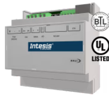
DALI-2 to BACnet/IP - 1 DALI channel

Integrate any DALI/DALI-2 driver and DALI-2 light or occupancy sensor with a BACnet BMS or any BACnet/IP controller. This integration aims to make DALI devices and their data and resources accessible from a BACnet-based control system or device as if they were a part of the BACnet system and vice versa.