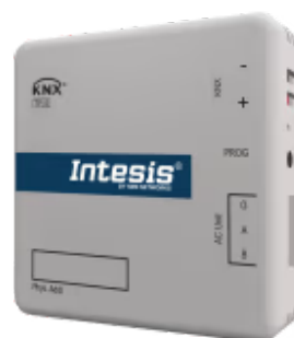
Haier to KNX - 8 indoor units

The Haier-KNX gateway allows bidirectional communication between Haier Commercial and VRF systems and KNX installations. This communication brings total control of the AC unit from KNX, including monitoring of the AC unit's internal variables, running hours counter (for filter maintenance control), and error codes.