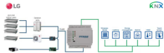
LG to KNX - 64 indoor units

The LG interface has been specially designed to allow bidirectional control and monitoring of LG VRF systems from a KNX installation. This enables the control of all the indoor units connected to the system, the monitoring of the main AC functions, and access to some internal variables of the outdoor units.