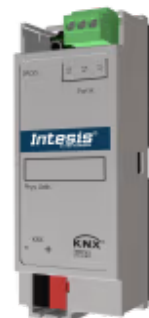
Modbus RTU to KNX - 100 points

Integrate any Modbus RTU server device with any KNX device or system using ETS. This integration aims to make any Modbus registers data and resources accessible from a KNX system as if they were a part of the KNX system and vice versa.