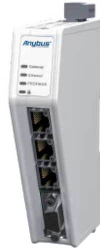
A protocol converter that connects PROFIBUS DP and Industrial Ethernet control systems

The Anybus Communicator PROFIBUS DP Device to Common Ethernet enables you to connect any PROFIBUS DP control system to any PROFINET, EtherCAT, EtherNet/IP, or Modbus TCP control systems. Anybus Communicators ensure reliable, secure, high-speed data transfers between different industrial networks. Thanks to our intuitive web-based user interface, they're also incredibly easy to use.