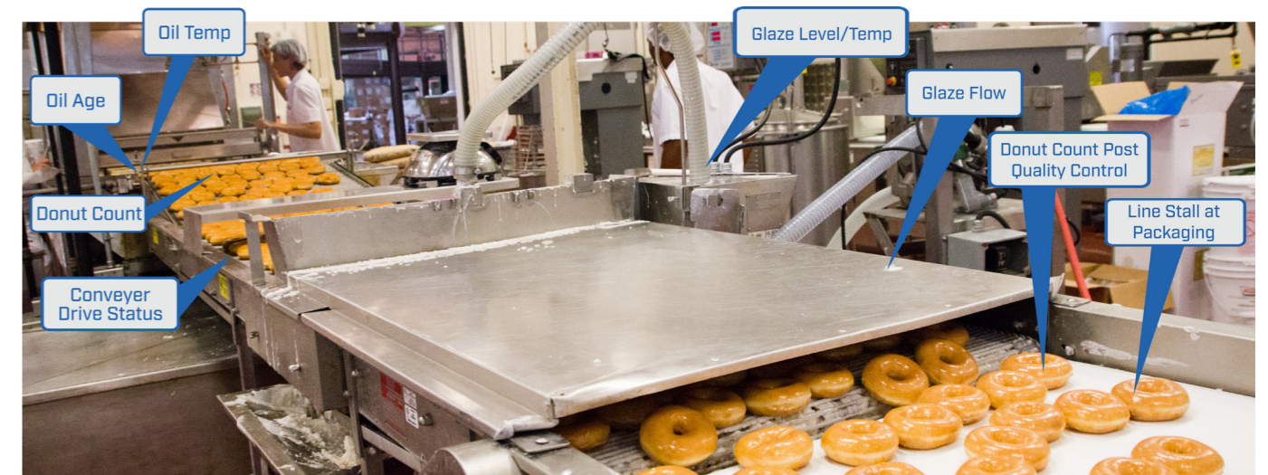
Donut manufacturing facilities are currently using HMS technology to lower costs and improve productivity.

The manufacture can expose the platform to their entire team and measure the results of the solution by fully optimizing the line. The results can then be used to justify further investment across the organization.