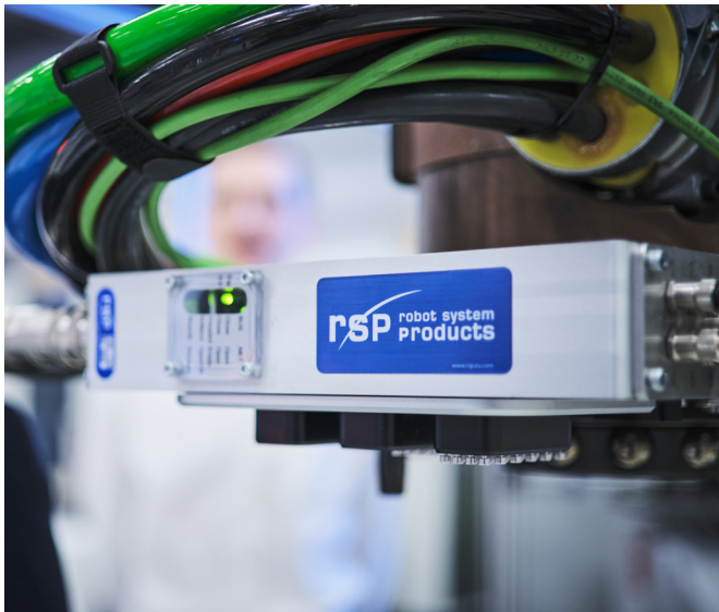
Figure 1: The Moduflex tool changer is attached to the robot enabling the robot to change tools quickly and safely