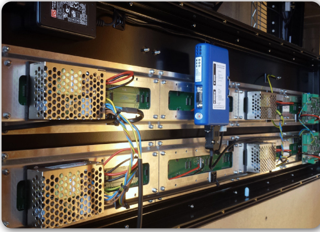
Behind the display. The Anybus Communicator in action inside one of London Electronics' displays, converting data from the PROFIBUS network to the display system.