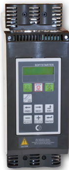
CG Drives’ new soft starter, the Emotron TSA, is the first in a new series of soft starters from CG Drives. With Anybus CompactCom, customers can access exactly the network they need.