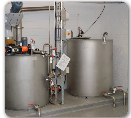
Inside the water station, sodium is added to raise the water’s pH.