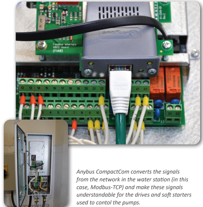
Anybus CompactCom converts the signals from the network in the water station (in this case, Modbus-TCP) and make these signals understandable for the drives and soft starters used to control the pumps.