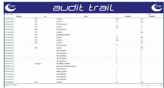
Access historic data such as operator changes to settings.