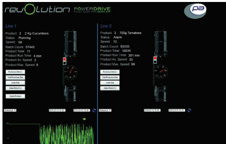
Mobile dashboards allow you to compare OEE stats across different products on each line.