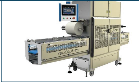
Single lane tray sealer 'Revolution' by Packaging Automation Ltd.